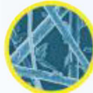
PET DANDER 寵物皮屑