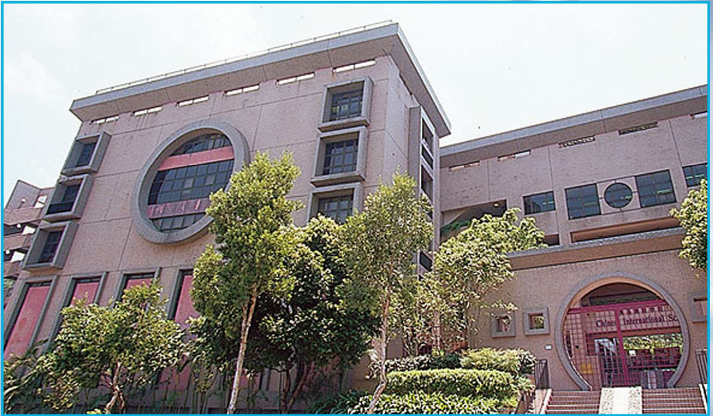
Chinese International School 漢基國際學校