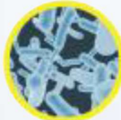
VIRUSES 病毒/ 過濾性病毒