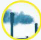
VOCs 揮發性 有機化合物