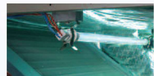
Key products: DE Series, SE and SEN Series, Fan Coil UVC Kit, SterilWand™.