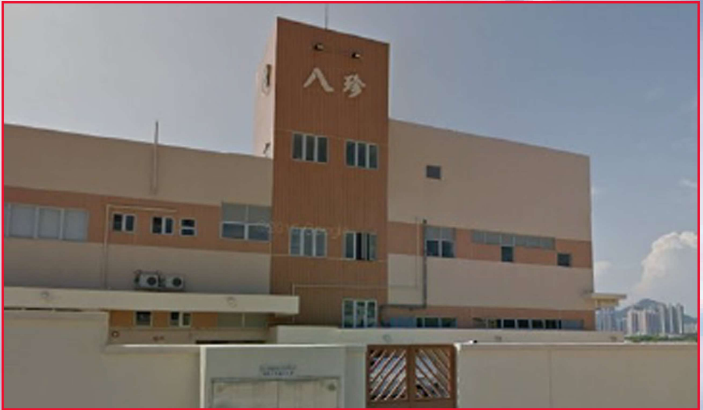
Pat Chun International Limited 八珍國際有限公司