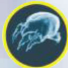
DUST MITES 塵蹣