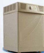
SZ-201 Air purification