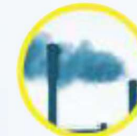
VOCs 揮發性 有機化合物