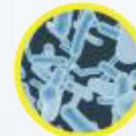
VIRUSES 病毒/ 過濾性病毒