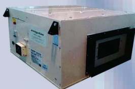
RSV-SZC-600 Germicidal Air Sterilizer Steril-Zone Ceiling Mounted Unit