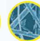
PET DANDER 寵物皮屑